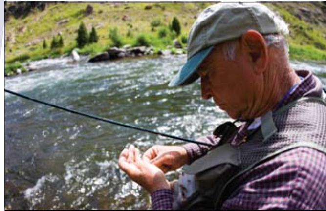
Yvon Chouinard choosing a fly in the Teton Canyon.