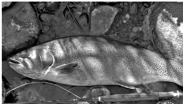
Native cutthroat trout.

tween water users and instream flow advocates. Live streams connecting the mountains with the Teton River will not only improve Teton Valley fisheries; they will also increase property and aesthetic values and create a tremendous resource for our community.