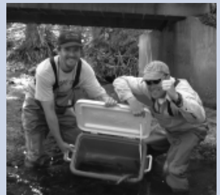
Left: Completed step weirs at Town Canal on Trail Creek; Right: Yellowstone Cutthroat Trout Rescue on Badger Creek.

the existing fish ladder at the main diversion on Trail Creek. Additionally, FTR completed a stream restoration project at Brookside Hollow where we stabilized 600 feet of eroding streambank, installed three J-hook weirs and planted vegetation.